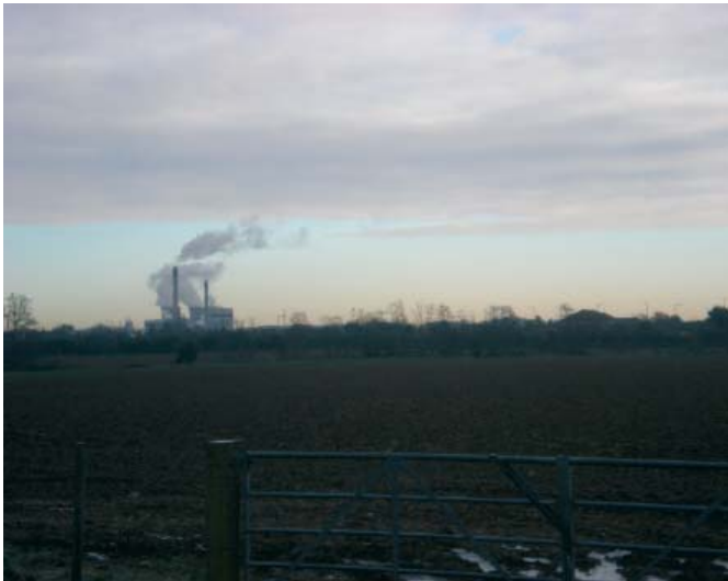
Expansive views towards Slough.