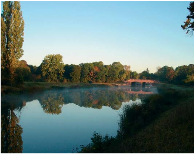
Jubilee River, meanders through the landscape. Scattered trees associated with waters's edge.