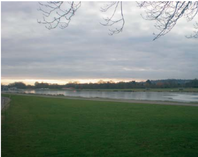
Dorney Lake, a purpose built rowing lake. Open expansive water and wooded periphery.