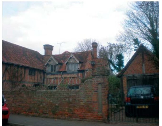
Historic character of settlement. Typical old red brick buildings.