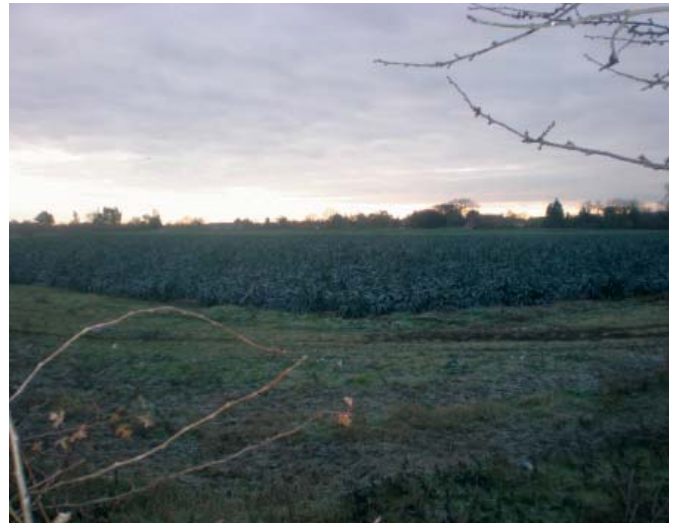
A flat, low lying floodplain, with large open arable cultivation,